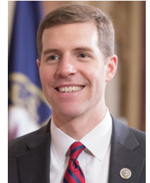
Conor Lamb (D)