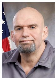
John Fetterman (D) johnfetterman.com

Each state regardless of its population has two Senators. This Primary determines which of four Democratic candidates* will be on the November ballot for PA's one open Senate seat. * Candidates are listed alphabetically.