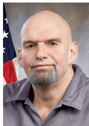
John Fetterman (D) johnfetterman.com

Each state regardless of its population has two Senators. This Primary determines which of four Democratic candidates* will be on the November ballot for PA's one open Senate seat. * Candidates are listed alphabetically.